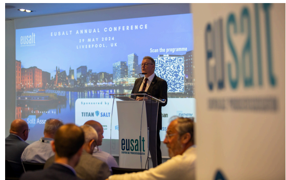
EUsalt Annual Events 2024

This year's Annual Events will be held in Bucharest (RO) . Join us to connect with EUsalt members on 10-13 June 2025 .